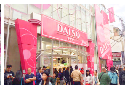
Harajuku Store (133tsubo · 440 m²)