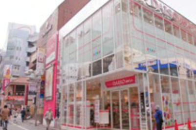
Shibuya Center Gai Store (98tsúbo · 324m²)