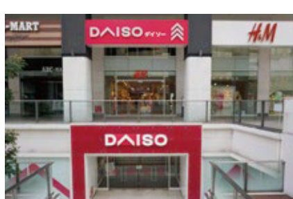
Osaka Umeda store (738tsubo · 2,440 m²)