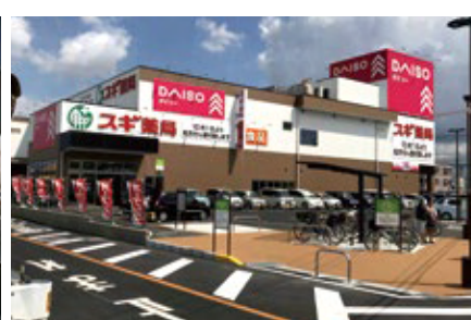
Toyohashi Shimoji store (498tsubo • 1,646 m²)