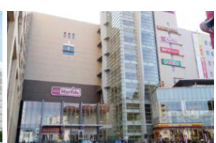
Hiroshima Danbara store (597tsubo·1,974m²)