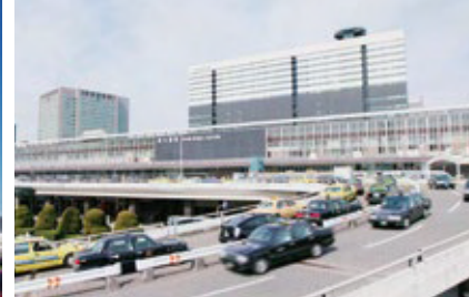
Arde Shin-Osaka Store (42tsubo·139㎡)