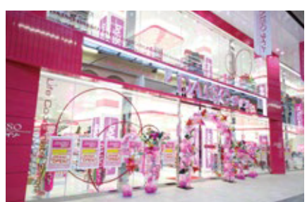
Shinsaibashi Store (289tsubo · 955m²)